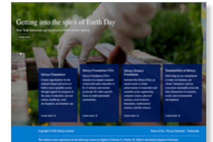
Infosys Corporate Social Responsibility Microsite