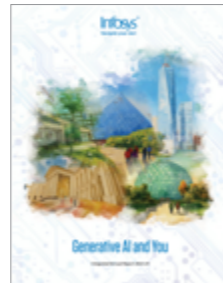
Infosys Integrated Annual Report 2023-24

Our ESG disclosures are reviewed and verified internally by an independent group, namely, Corporate Certifications and Assessments Team (CCAT). Select non-financial sustainability disclosures are assured by Deloitte Haskins and Sells LLP. The Independent Assurance Statement is available as part of the ESG Data book .