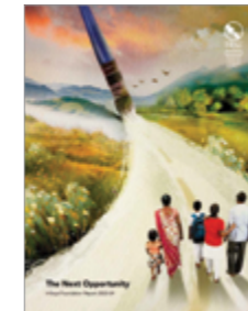
Infosys Foundation Report 2023-24