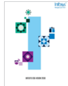
Infosys ESG Vision 2030