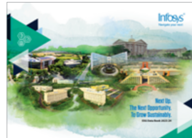
Infosys ESG Data Book 2023-24