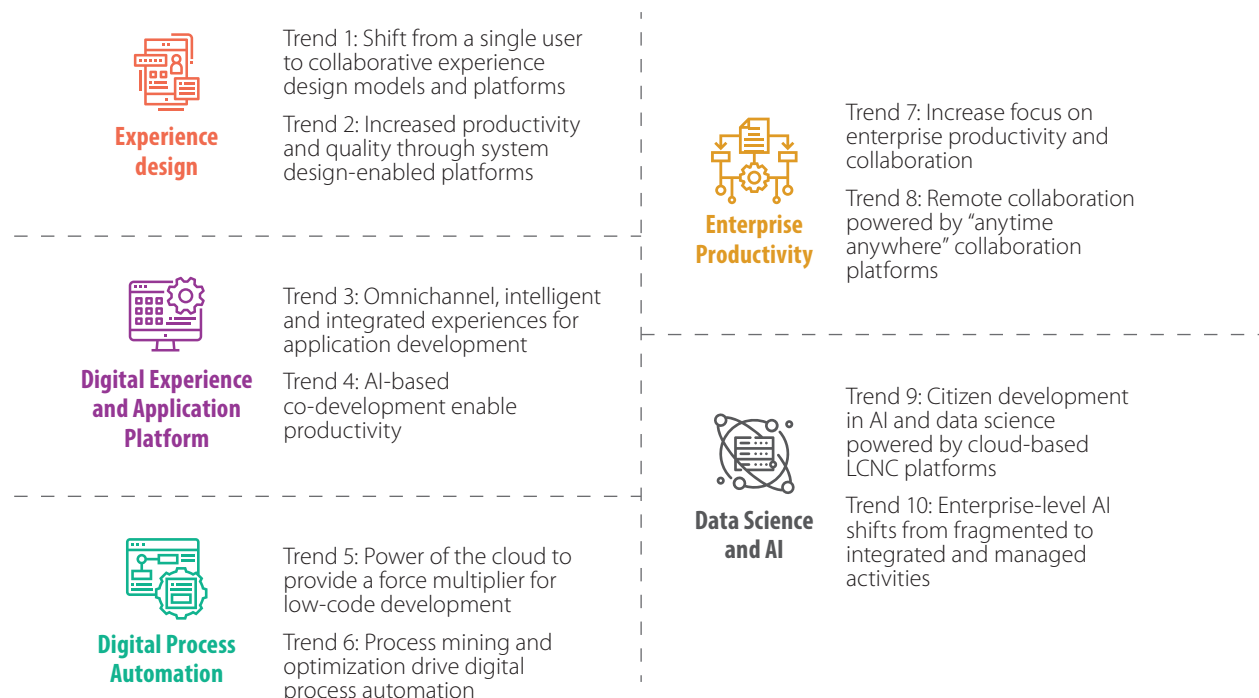
Figure 2: Key LCNC trends across technology domains