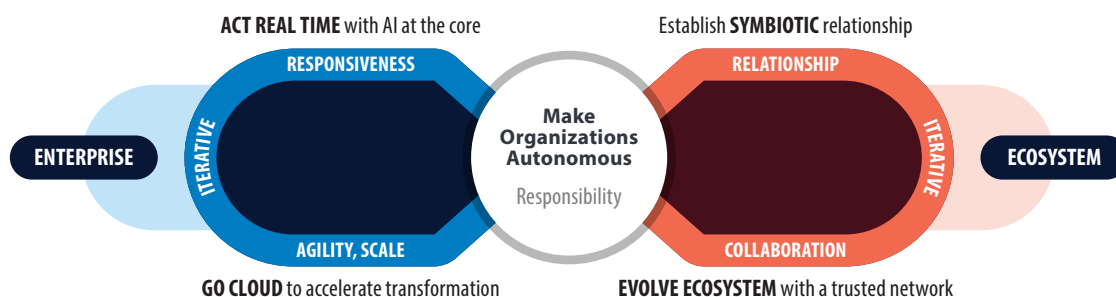
Figure 2: Structure of autonomous organizations